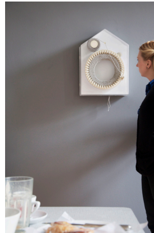
DEVELOPING TIME - TIME DEVELOPING, KNITTING CLOCK

PLEASE GO TO WWW.TIMETODESIGN.EU TO DOWNLOAD PRESS MATERIAL