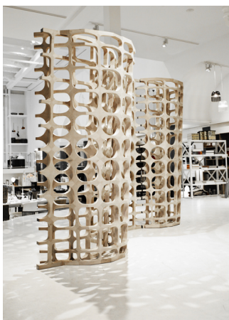
SATURATED POROSITY - FREESTANDING SCREEN BY ANNE ROMME