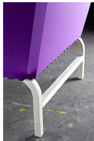
SPAZIALE SERIES BY LANZAVECCHIA + WAI OUR, CHAIR DETAIL